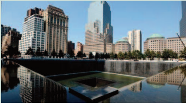
The World Trade Center Memorial Fountain

The largest manmade waterfall in North America is waterproofed with CIM. When it came time to select the toughest waterproofing system for the World Trade Center Memorial Fountains, the design consultants chose CIM. No other waterproofing could meet the performance requirements of the extreme environment present at New York City's largest construction site.